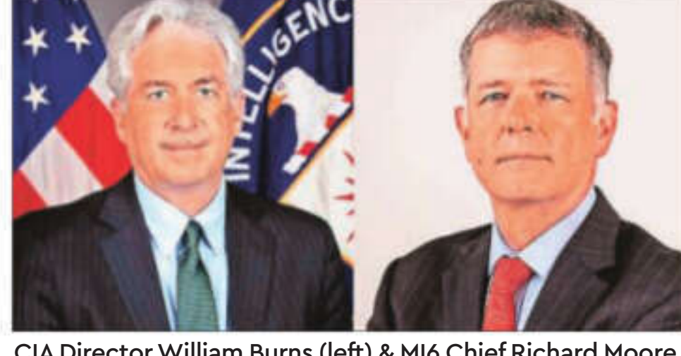
CIA Director William Burns (left) & MI6 Chief Richard Moore

Speaking alongside Moore at a rare public event in London, CIA Director William Burns said the offensive was a "significant