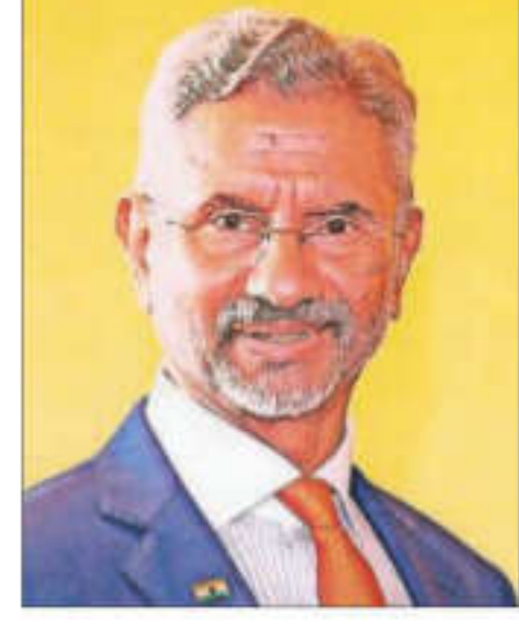
based Indo-Pacific against the backdrop of China's growing muscle-flexing in the region.

The Quad, comprising India, the US, Australia and Japan, has emerged as a key coalition focusing on working towards ensuring a free, open and rules-