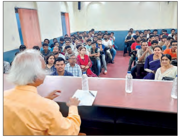
ক্যান্সার সচেতনতায় পেস-এর আলোচনাসভা।

আজকালের প্রতিবেদন: ক্যান্সার থেকে রক্ষা করতে পারে টেমস্টো, পোয়াজ, রসুন। পাশাপাশি এটিয়ে চলতে হবে তামাক, আলকোহল।